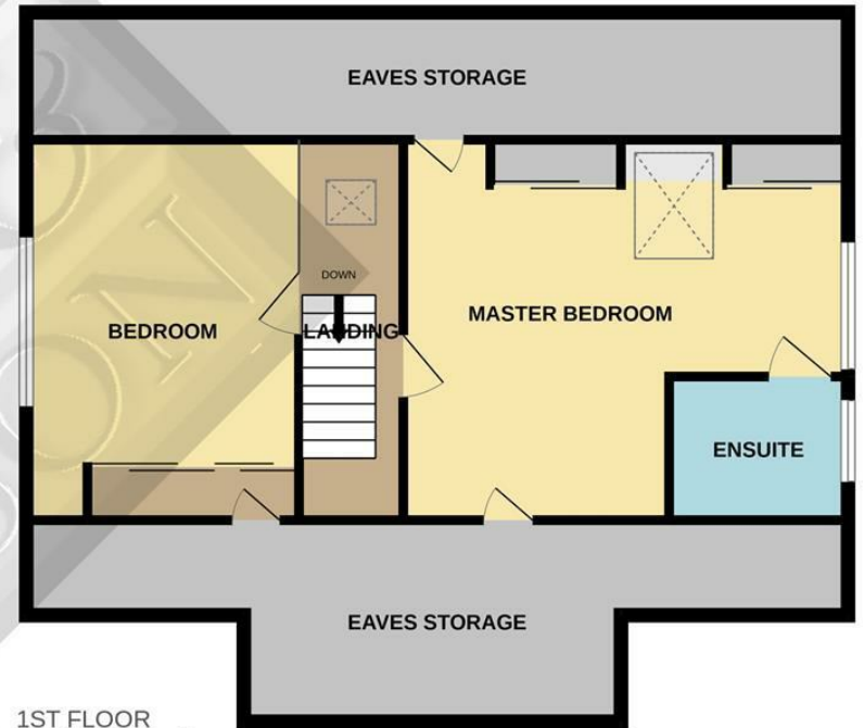
1ST FLOOR 867 sq.ft. (80.5 sq.m.) approx.

TOTAL FLOOR AREA : 2315 sq.ft. (215.1 sq.m.) approx.